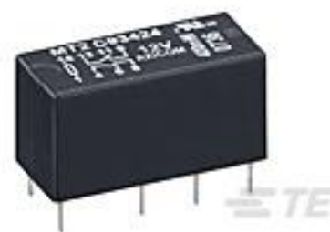
TE Part # 1-1462000-8 C93404=MT RELAY 150MW 48V