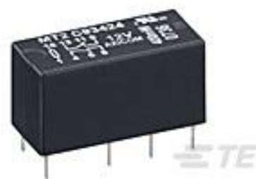
TE Part # 4-1462000-5 C93420=MT Relay 200 mW 48 V